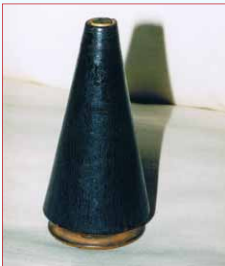
The leather cone fabricated for the Ball and Cone routine is in the author's collection.