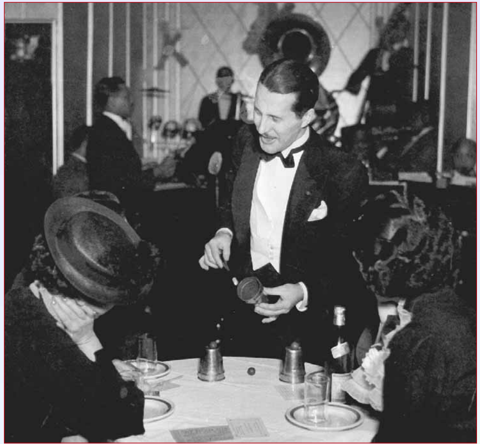
Vernon performing the Cups and Balls at New York City's Kit Kat Klub in 1936, two years prior to the creation of the Harlequin Act.

The answer: a harlequin. Harlequin or arlequin , a character whose Comedia Dell'Arte dramatic roots are often connected to the comic representation of a medieval demon, had