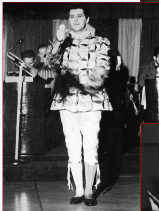
The surprise appearance of the billiard ball for the Ball and Cone routine.