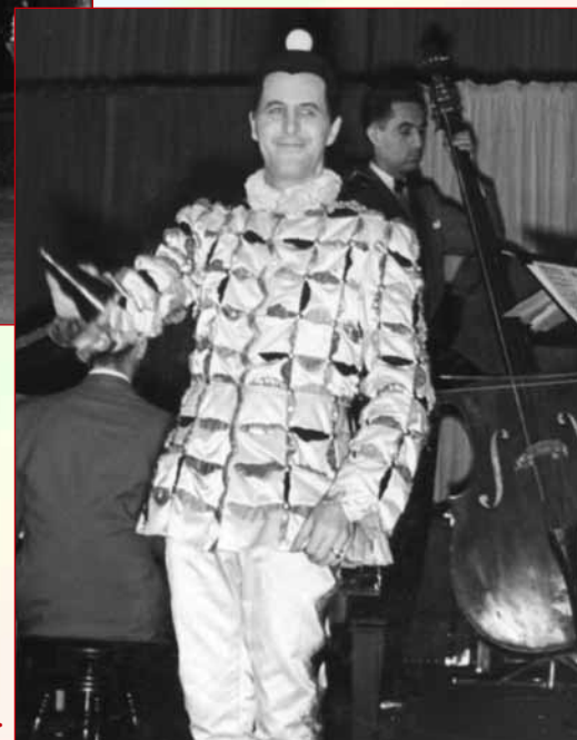
A playful moment when the ball was found not beneath the cone.