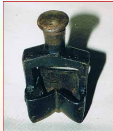
The die used to punch out the tissue butterflies was designed by magical craftsman Paul Fox.