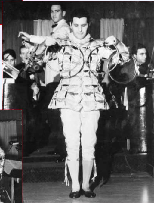
The minimalist Linking Ring routine performed with four rings.