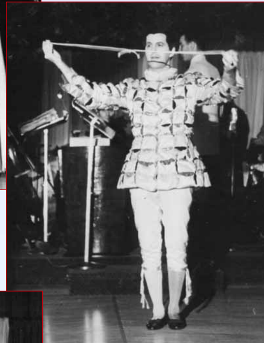
The 3-1 Rope Trick performed with a colorful sash cord.