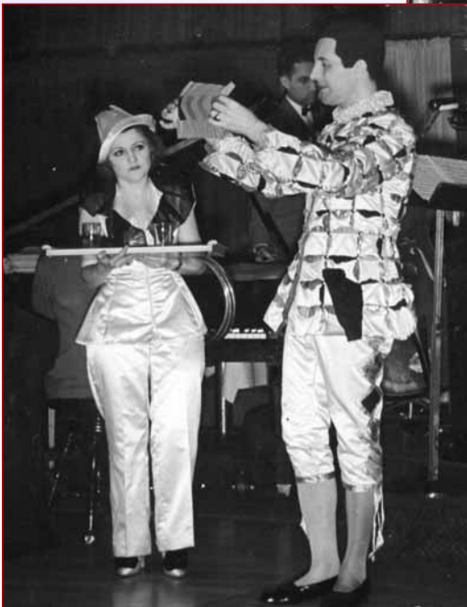
Tearing the tissue papers for the Butterfly/Snowstorm finale.